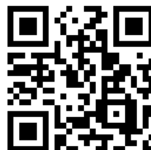
Figure 1 - Scan the QR code for calculator instructions.